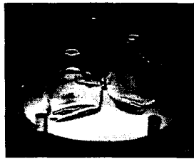
Fig. 1 The musicBottles installation and close-up of jazz bottles on table-top.

The bottles interface incorporates wireless sensing technology designed by Joe Paradiso at the MIT Media Lab [3]. Sensing the manipulation of the bottles is made possible through the use of small electromagnetic resonator tags placed around the opening of each bottle, and pieces of ferrite embedded in the corks. The resonant frequencies of the tags are detected through the use of a custom designed tag reader board and sent to the computer via the serial port. A master control program on the computer is responsible for interpreting the tag reader data and generating the appropriate sound and light output.