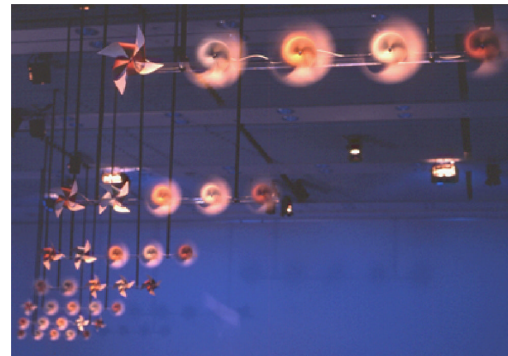
Figure 3 Pinwheels spinning in Tokyo in a wind of e-mail traffic at MIT

We mounted five pinwheels onto each of 8 supporting rods, and spatially distributed the rods across the gallery space (diagonally from the entrance to the back), with equal intervals between them. We decided to interpret this line of