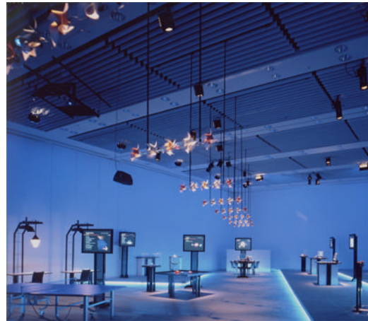
Figure 1 Overview of the gallery with 40 Pinwheels in the NTT-ICC museum in Tokyo

The Pinwheels evolved from the idea of using airflow in the ambientROOM project [2]. We found that the flow of air itself was difficult to control and to convey information.