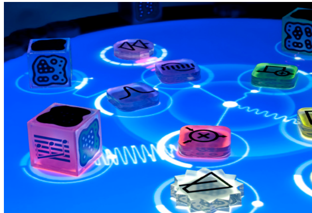
Figure 1. The Reactable

the number of fingers that can be used simultaneously. The Reactable was specially designed so that it could be used by several simultaneous performers (which justifies its round shape), thus opening up a whole new universe of pedagogical, entertaining and creative possibilities with its collaborative and multi-user capabilities.